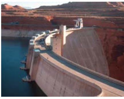
Pumps and pumping stations power supply